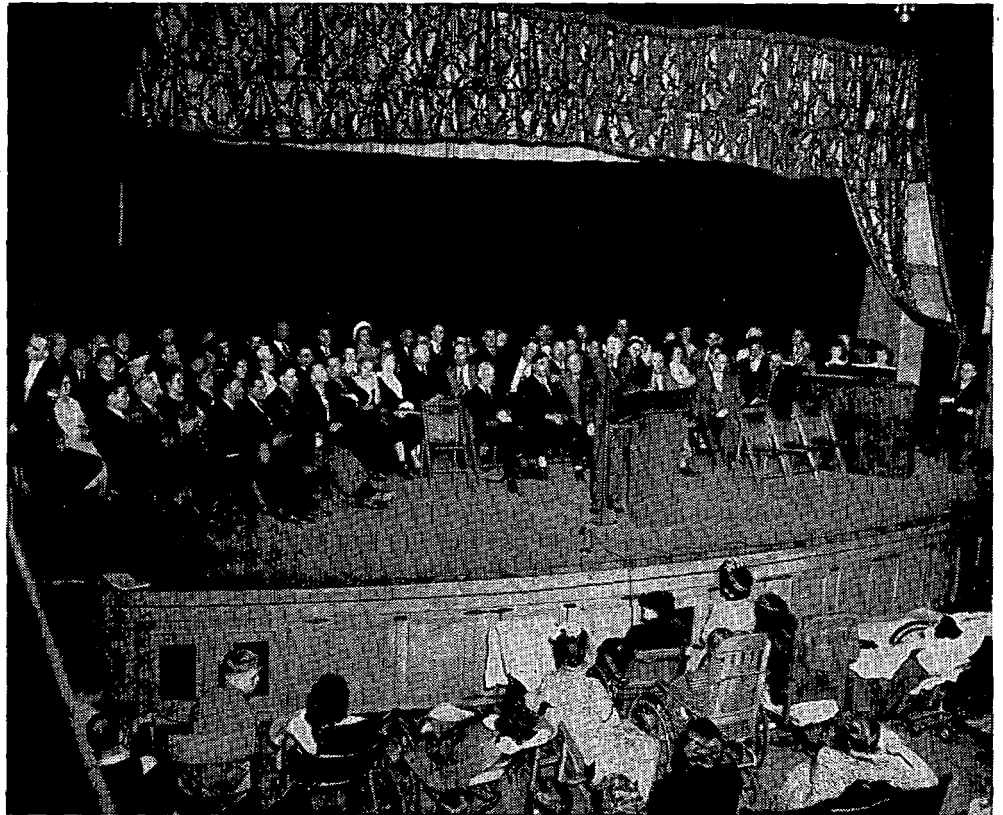
Branham campaigns provide a mutual meeting ground for ministers of various organizations. This group of ministers photographed in Elgin, Ill., is typical.

We offer Christ's answer again. Peter has asked a question: "How oft shall I