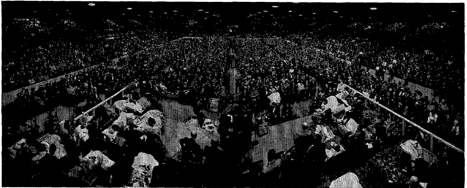
The great Tacoma ice arena seating 6,000 people filled the third night of Rev. Wm. Branham's appearance in the city.

During a noon hour luncheon, Brother Branham spoke to the ministers concerning some things that were on his heart. It was a solemn and impressive hour and not a few tears fell across the faces of ministers as they listened. Incidentally, the editor happened to overhear a remark or two between brethren sitting near him, which was typical. Said one to the other, "When this meeting is over, and while these wonderful things are all fresh in my mind, I want to get away a few days, and get alone with God."