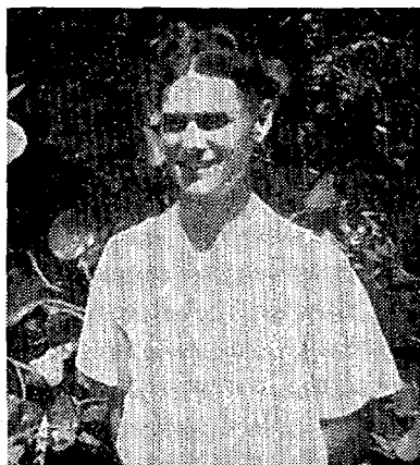
2768 N. W. 57 Street Miami 38, Florida Phone 7-0991 May 18, 1948

The Voice of Healing Box 4097 Shreveport, Louisiana