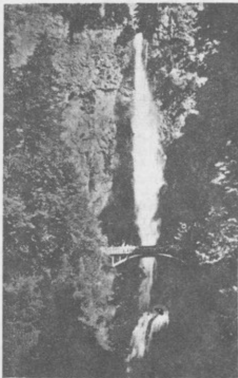
Beautiful Multnomah Falls (625 feet high) located near the scene of the accident at the Bridal Veil Timber Mill.

I looked around for some way to get out. There was no way to get out. I was about to give up in terrible despair, when I saw Something. It was Christ standing in the distance! Away on the horizon I saw Him. Hope sprang up in my heart. Somehow I knew that if I could get His