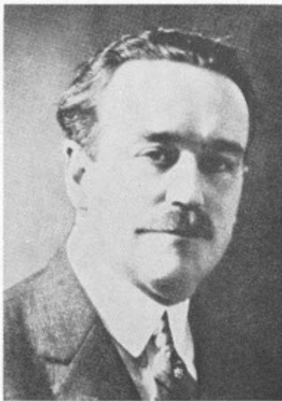
Rev. Chas. F. Parham

The words "if they have committed sins" signifies that in all probability sin was the cause of the sickness. The prayer of faith will save the sick, if coupled with the sincere prayers of the individual, but unless there is sincere repentance, the prayer of faith cannot prevail, for healing will not take place until the sin is forgiven. Such a case is illustrated in the healing of the man sick with the palsy (Luke 5). The elders indeed brought him and lowered him at the Saviour's feet. Jesus, seeing their faith and knowing the man's past, said: "Son thy sins be forgiven thee," and immediately he was healed. Forgiveness and healing must be concomitant.