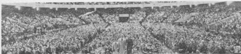
A BRANHAM AUDIENCE, ST. LOUIS, MO.—1947