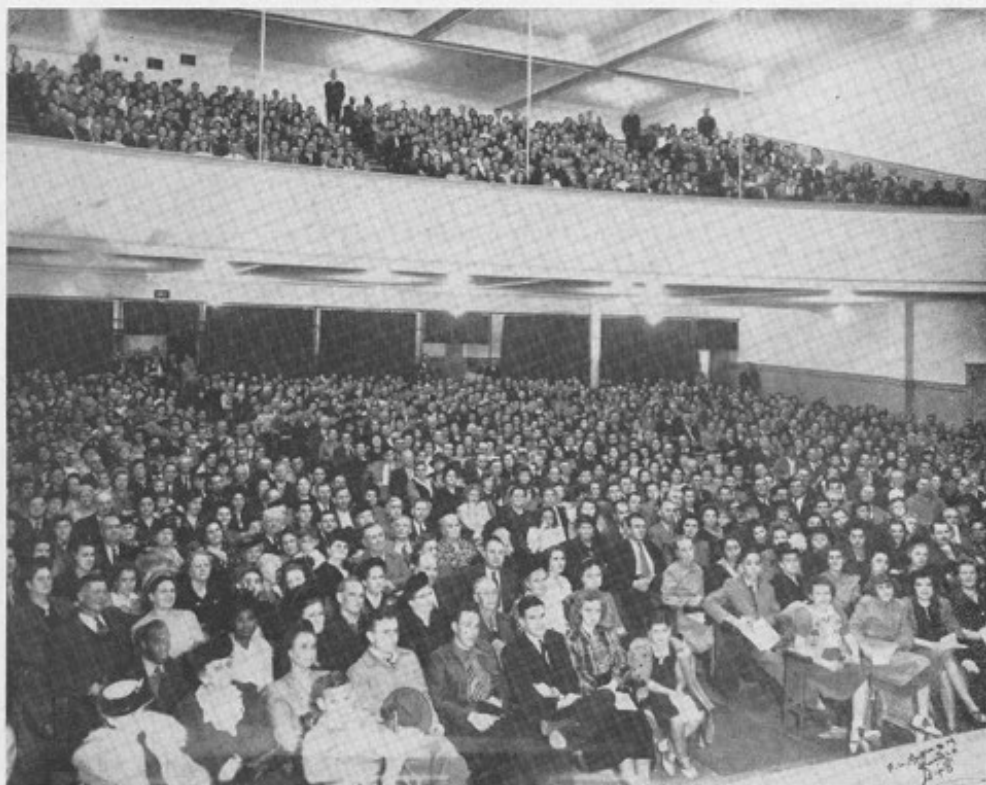
The photographer was able to get only a little more than half the audience which attended the Freeman Healing Campaign in the Arcadia Theatre in Wichita, Kansas.