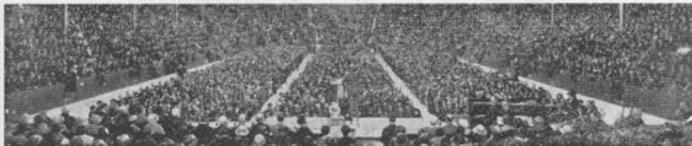
BOSWORTH REVIVAL, OTTAWA, CANADA—1924