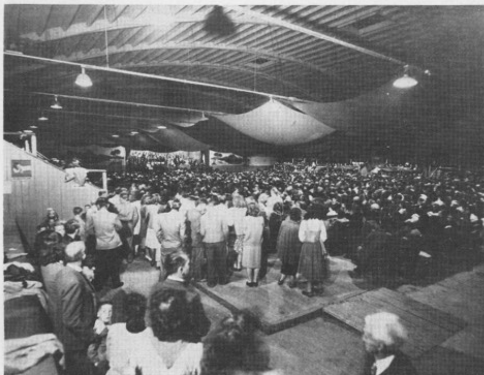
Photo taken on the last night in the Freeman Healing Campaign at the Melody Bowl at Bakersfield, Calif. A mechanical register used to count the people showed 4,585 present.