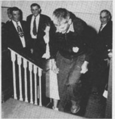
HE MOUNTS THE STAIRS Here he goes up the stairway after walking for some distance around the auditorium.