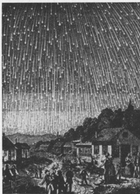
The great Leonid star shower of November 12-13, 1833, as drawn by a contemporary artist.

"For the stars of heaven and the constellations thereof shall not give their light: the sun shall be darkened in his going forth, and the moon shall not cause her light to shine. And I will punish the world for their evil, and the wicked for their iniquity. . . ."