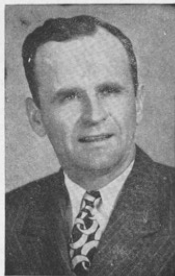
Rev. William Branham