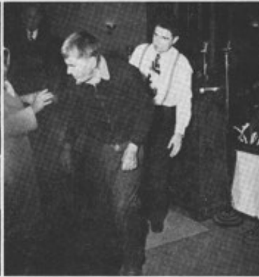
HE BEGINS TO WALK It is the story of Acts 3, repeated today. The lame man walked at Peter's command, while the people praised God.