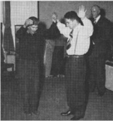
THE COMMAND TO RISE! Although the man has been confined to the wheel chair ten years, he rises at the command!