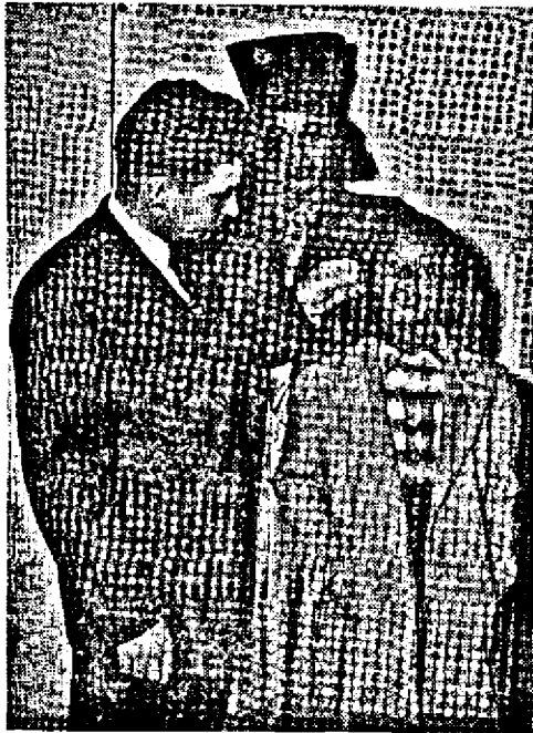
Former deaf mute returned to meeting still learning to hear and spell.