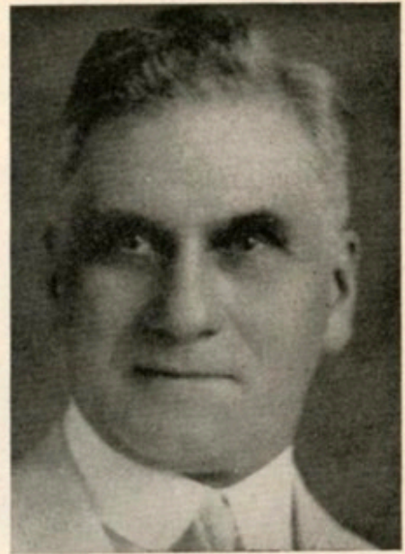
Dr. John G. Lake