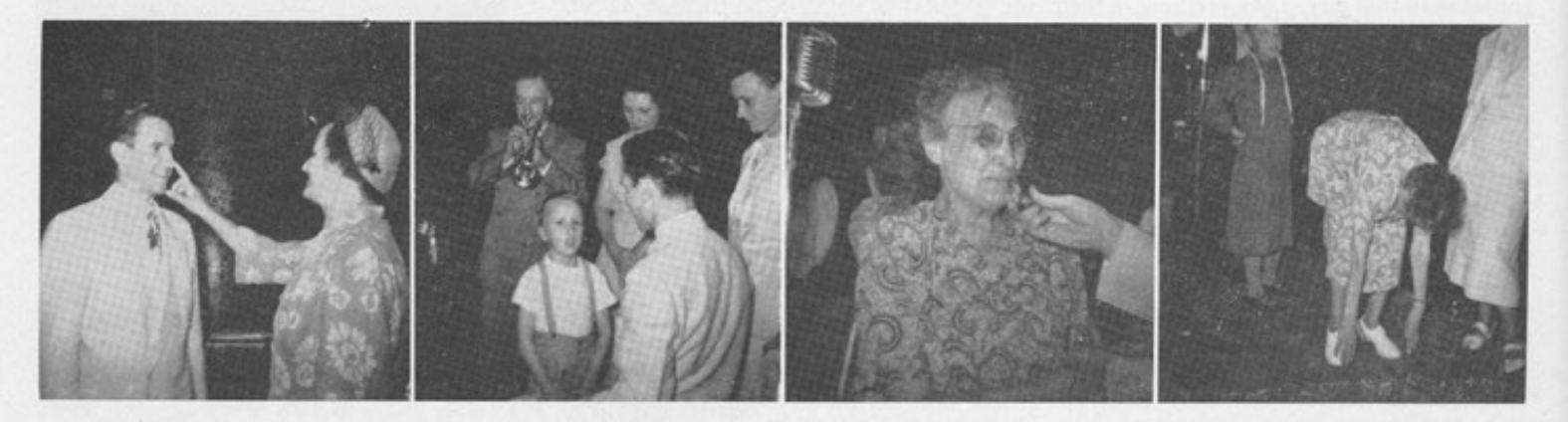
From left to right: (1) Blind lady receives sight; (2) deaf and dumb boy hears music from piano and trumpet after being delivered from the deaf and dumb spirit; (3) lady has sense of smell restored instantly (as many others), and (4) is healed of arthritis of the spine. Detroit Healing Campaign.

Miracles wrought in the Detroit Campaign