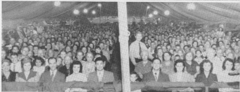
Ogilvie-Lindsay Great Tent Campaign at Mishawaka, Indiana