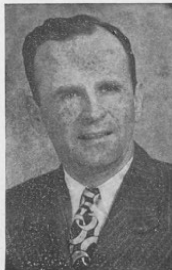
Rev. William Branham

Last summer the people of Canada were disappointed in that the Branham campaigns which had been scheduled for their cities had to be cancelled, due to the physical inadequacy of our Brother William Branham. However, conditions turned in their favor; during these summer months many thousands have been privileged to witness and receive the gifted ministry of Brother Branham.