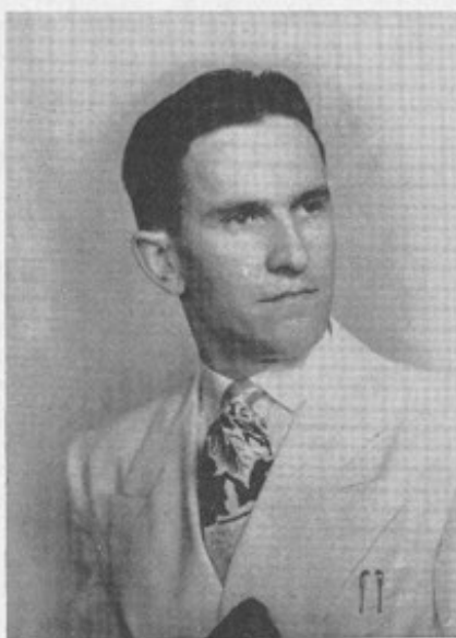
EVANGELIST T. L. OSBORN Tulsa, Oklahoma