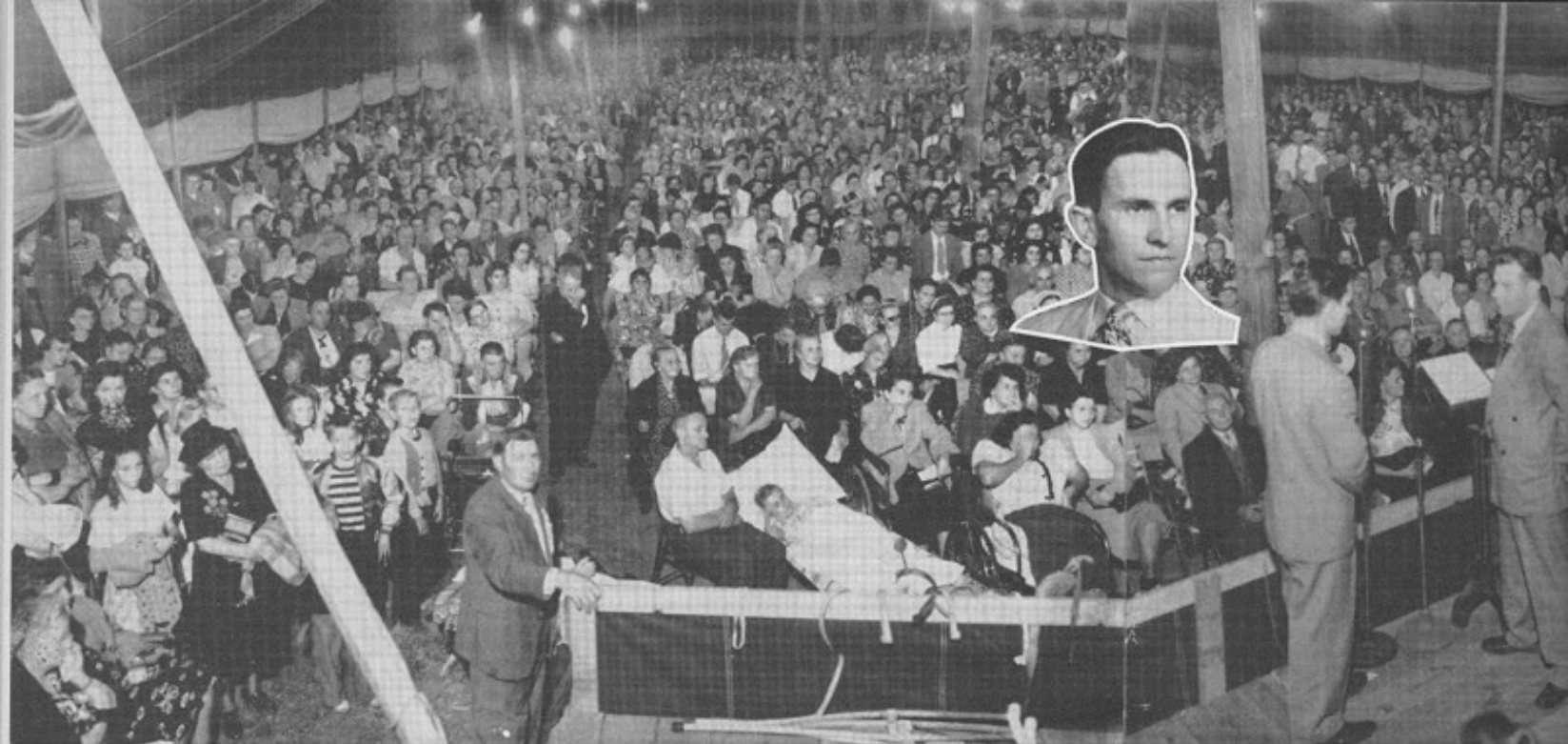
Osborn-Lindsay Healing Campaign in Reading, Pennsylvania. Some 3,000 were present on this Saturday night. On the following night, there were 4,000 in attendance. About 3,000 responded to the altar call during these meetings, and many miracles took place. Insert