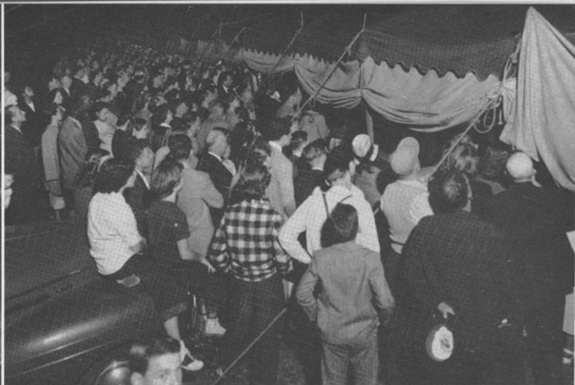
Part of the overflow crowd which circled about the tent.