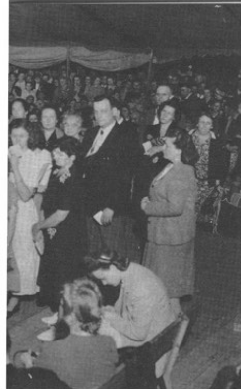
it was estimated that there .. Osborn.