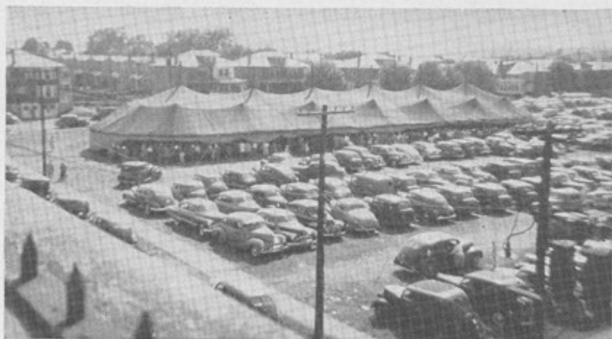
In the thriving manufacturing city of Reading, Pa., the big tent is packed and throngs crowded around the outside, as can be seen in this aerial photo.

"A Fine Thing for Our Community" . . . Writes Pa. Judge