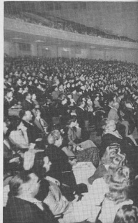
This late photo, showing part of a torium, was taken during the Jagers this issue is being compiled. Denominations by means of newspaper, radio and other means being healed and baptized with the Spirit.