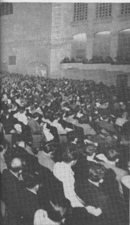
4,000 people in the Fair Park Auditorium in Dallas which is still in progress as churches are challenging this evangelist's claims, but many of their members are

JAGGERS Book-of-the-Month, "Physical Health"