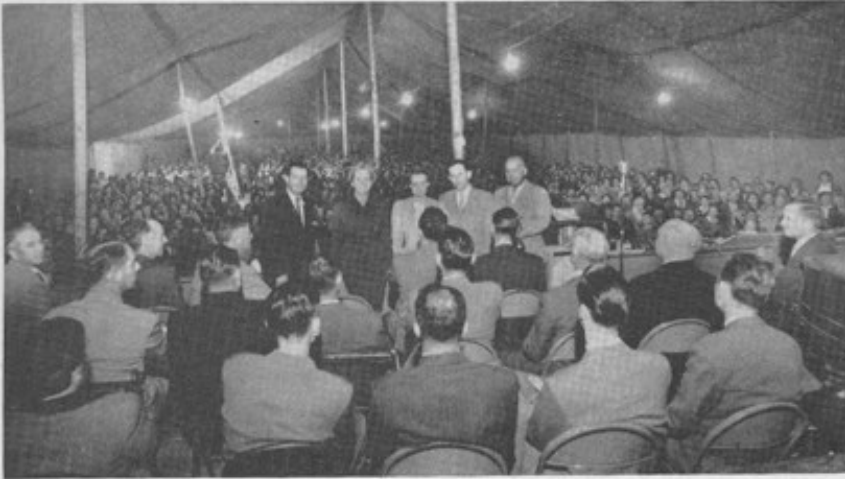
In spite of floods and unseasonable temperatures, the Osborn-Lindsay meeting in Corpus Christi was successful in the large 210 foot tent.