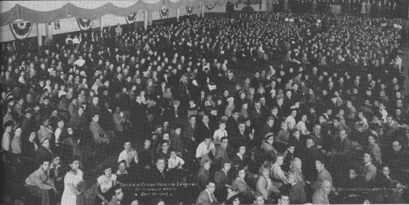
Photograph of The Great Ogilvie-Kaplan Campaign in St. Nicholas Arena, New York City