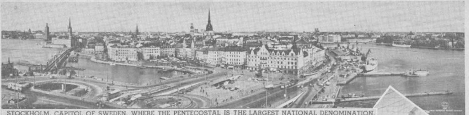
STOCKHOLM, CAPITOL OF SWEDEN, WHERE THE PENTECOSTAL IS THE LARGEST NATIONAL DENOMINATION.