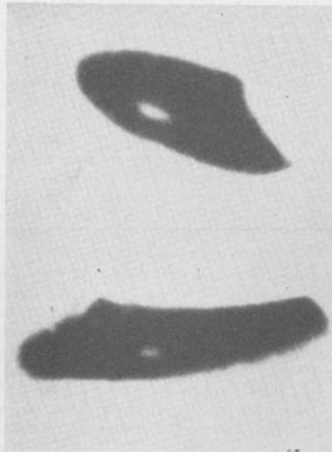
Actual photographs of "Flying Saucers."

Some have thought that the Flying Saucers are in reality new weapons that have been devised and are being developed by our Air Force. Apart from the official denial of any such project is the fact that it is hardly likely that the Air Force, having some super-secret weapon, would expose it