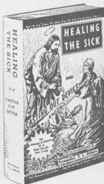
Our Book-of-the-Month Price $2.50. Order from Box 4097—Shreveport, La.

If we talk sickness, it is because we believe in sickness. If, after we have been prayed for, and have had the hands of believers laid on us, we still persist in talking