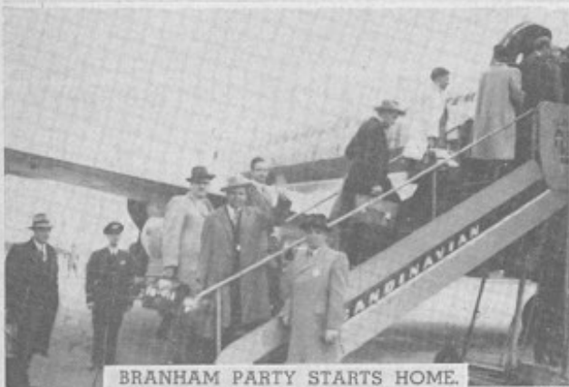
BRANHAM PARTY STARTS HOME.