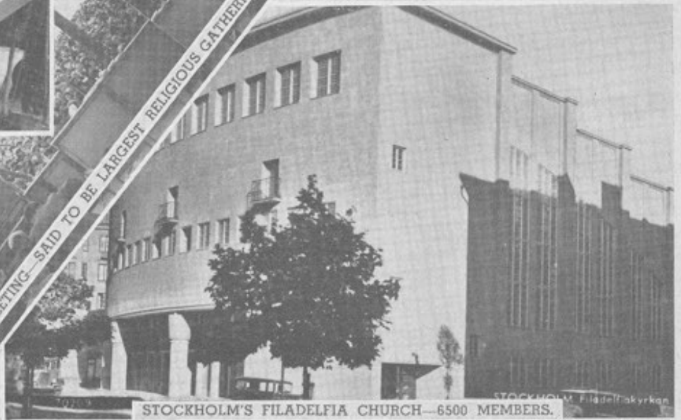
STOCKHOLM'S FILADELPHIA CHURCH—6500 MEMBERS.

CROWD AT BRANHAM MEETING SAID TO BE LARGEST RELIGIOUS GATHERING IN HISTORY OF THE WORLD IN THIS ARCTIC CIRCLE TERRITORY.