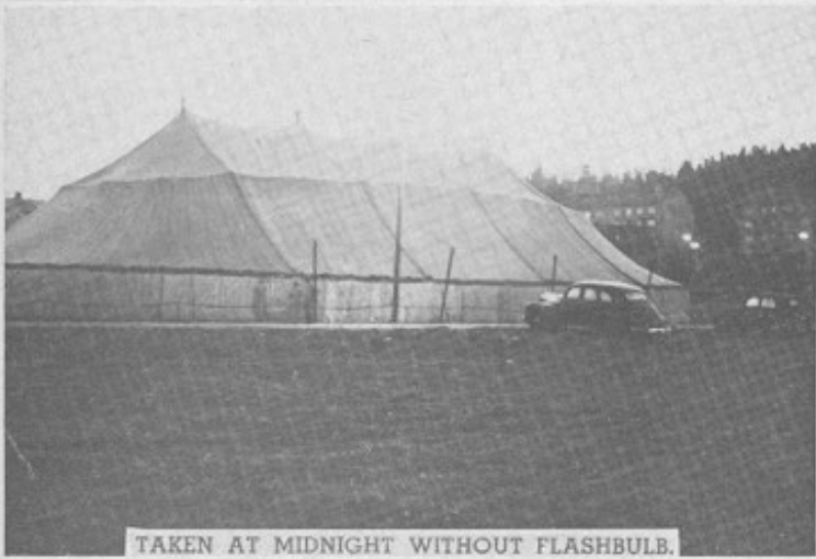
TAKEN AT MIDNIGHT WITHOUT FLASHBULB.