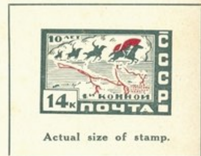
Actual size of stamp.

Is the Korean struggle beginning of the end? Will atomic warfare begin soon?