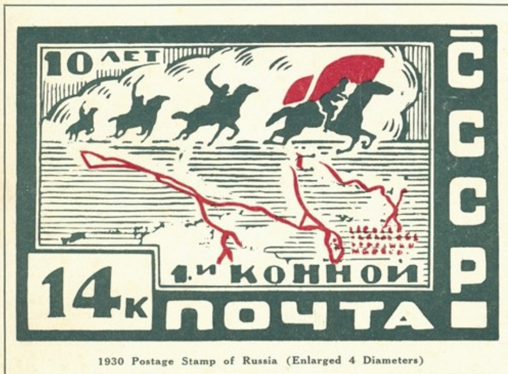
1930 Postage Stamp of Russia (Enlarged 4 Diameters)

"And thou (Rosh) shalt come from thy place out of the North parts, thou and many people with thee, all of them riding upon horses . . . and thou shalt come up against my people of Israel, as a cloud to cover the land: it shall be in the latter days . . ."